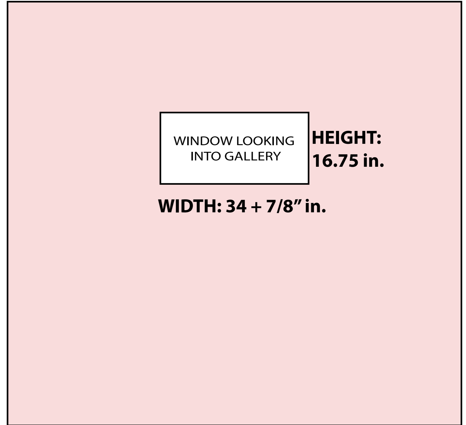
RIGHT WINDOW WALL, FROM STREET